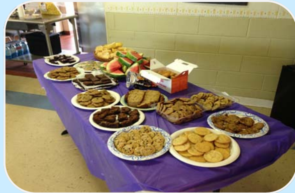
This evening of fun and fellowship on May 31, was sponsored by our Middle School Youth Group. Great fun was had by all!